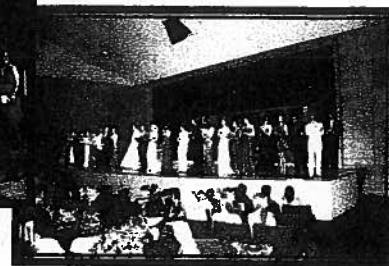
Fashion Show 2009