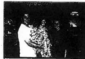
Students win big at D&B's, 2008

families made up the difference, along with other fundraising we held throughout the year. Last year, in 2009, over 300 students attended PP-the largest senior group yet! Again held at D&B's, the students had game cards loaded, enjoyed a fresh fruit & dessert bar, & received some new gifts: Guitar Hero, tickets to Morey's Pier, a $300 Steve Madden shoe gift card, along with the staple gifts of years' past.